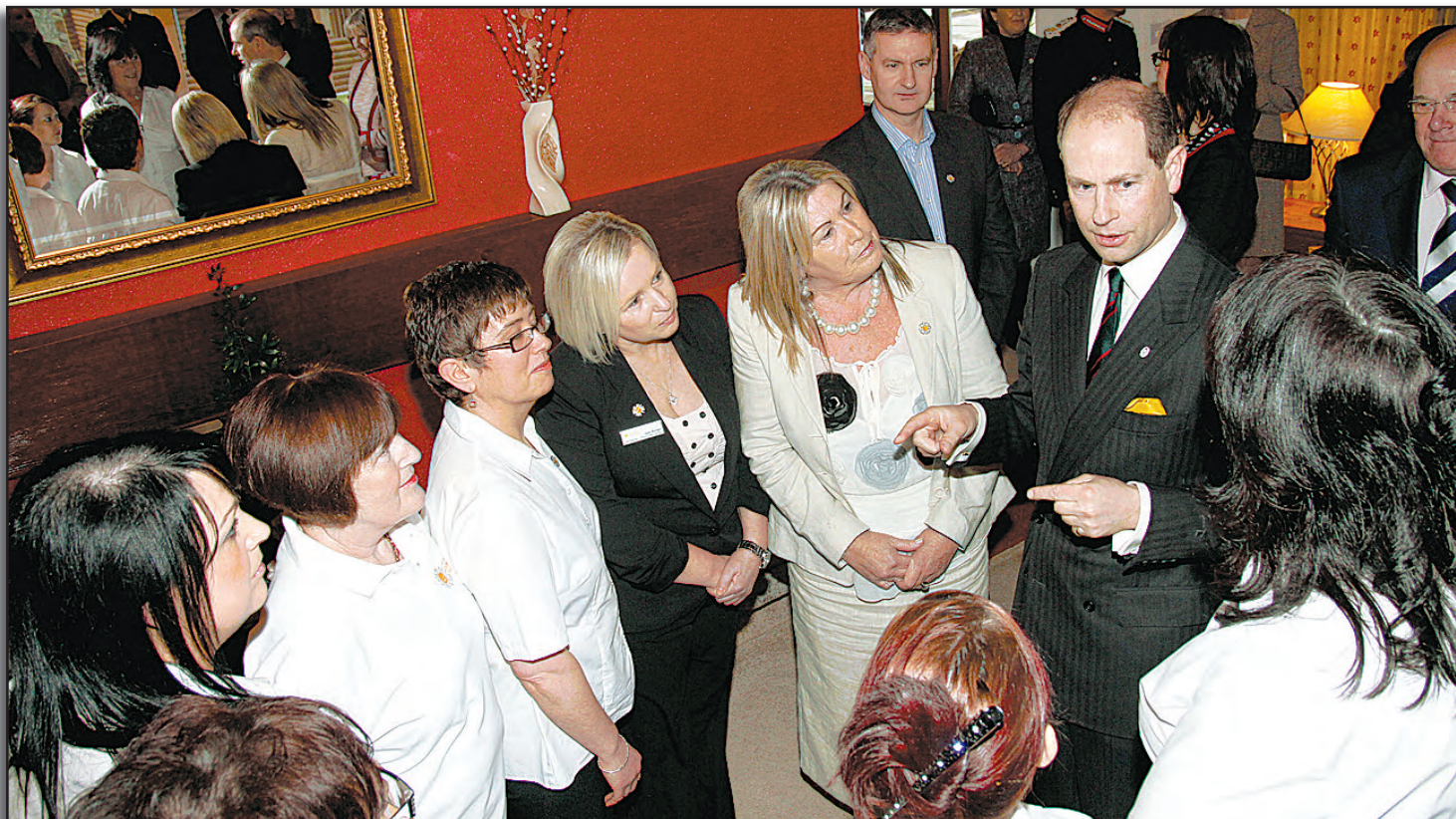
A WELCOME IN THE VALLEY.. HRH The Earl of Wessex with local staff members during his visit to the Northern Ireland Cancer Fund for Children's Shimna Valley complex in Newcastle yesterday (Tuesday) afternoon. Full coverage on Pages 31 - 33.

PRINCE Edward, the Earl of Wessex, arrived in Newcastle yesterday to meet the volunteers, staff and supporters of the Shimna Valley complex.